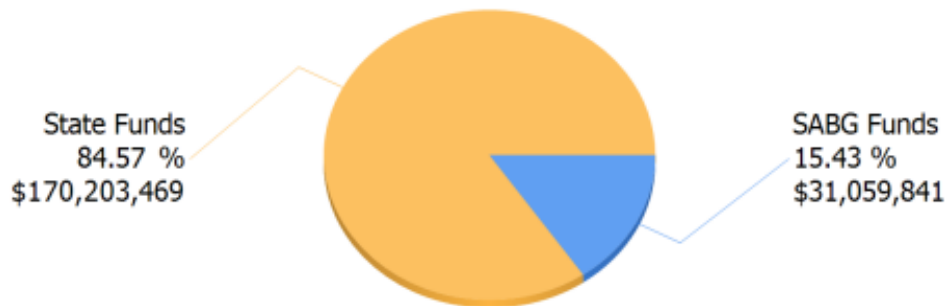
Exhibit 1: Sources of Massachusetts’s 2021 Expenditures for Substance Abuse Prevention and Treatment

States submit Behavioral Assessment and Plan reports that include their priorities for use of SABG funds, as well as planned expenditures. For FY 2022-2023, Massachusetts designated decreasing substance use among young people as priority number three for use of SABG funds. 3